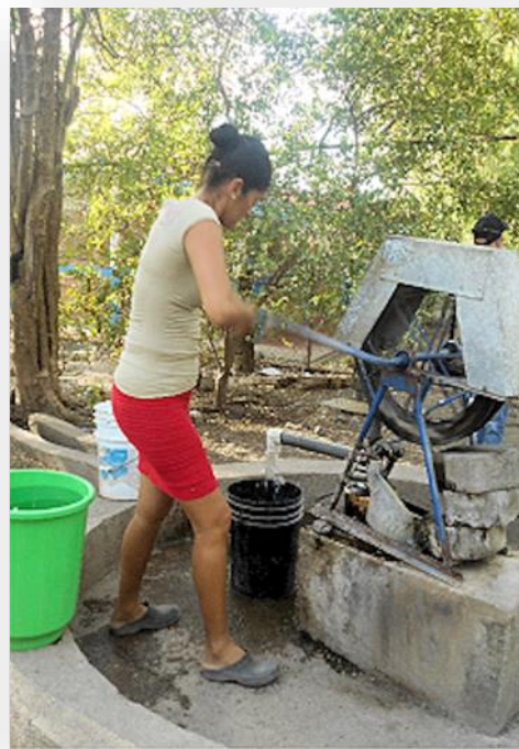
A La Palma, Nicaragua, woman pumps well water by hand.