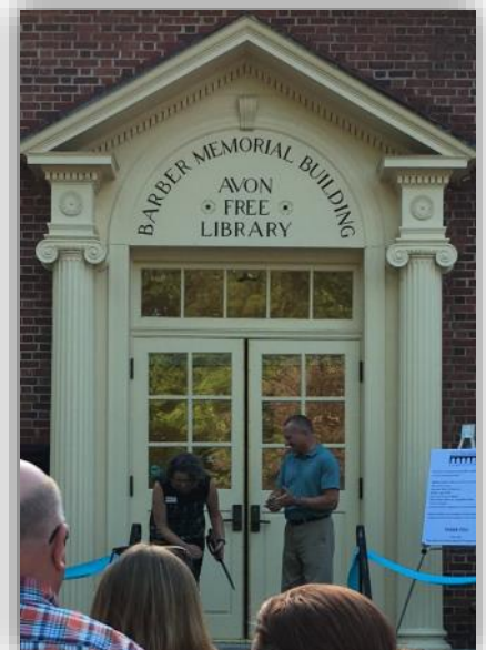
Avon Free Library celebrated the grand re-opening on this night. Avon Rotary was thanked for the generous contribution of $8,000.