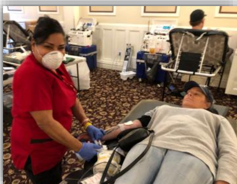
A Red Cross associate draws blood from a donor at the Avon Inn.

There are many opportunities coming up for those who want to give blood. Avon Rotary's next scheduled drive will be Tuesday July 28th from 1:30 until 6:00 pm at the Avon Inn. It will be the 7th Avon Rotary Club sponsored blood drive. More can be found by going to redcross.org . Click on "Give blood," then "Find a blood drive" and enter your ZIP code.