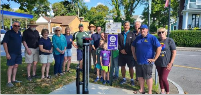
Members of Avon Rotary, Avon Lions, the Village and Town Boards, and Avon Parks Commission.