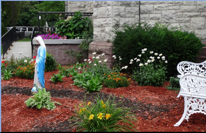
Garden maintained by the club at St. Michael Church