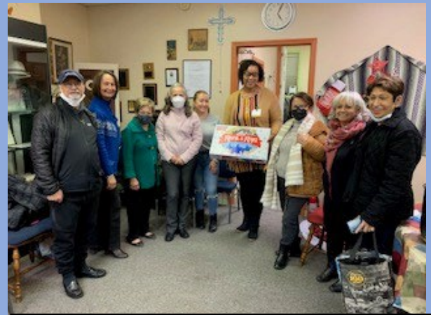
Members and volunteers at Easter dinner