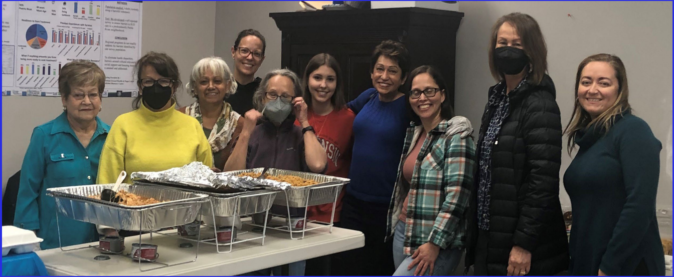
Top: The cooks and servers ready to start serving dinner.