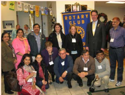
Brighton Club hosted a reception for the DGEs