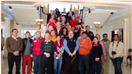
DGEs and their hosts visited Eastman House