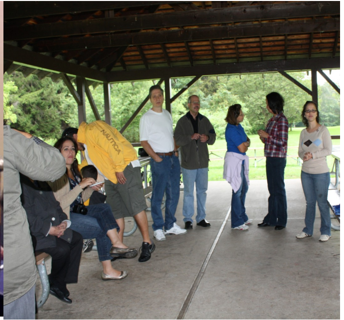
Above right: Prospective members attended the picnic