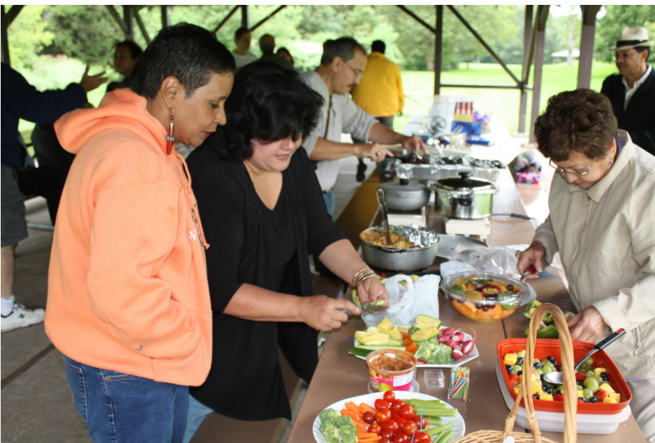
Below left: In spite of the wind and cold weather, Rotarians and their family enjoyed the picnic in Webster Park