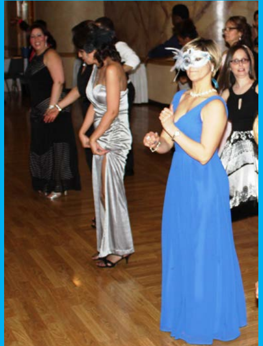
Immediate left: A great variety of silent auction items Top right: Women enjoyed a salsa dance