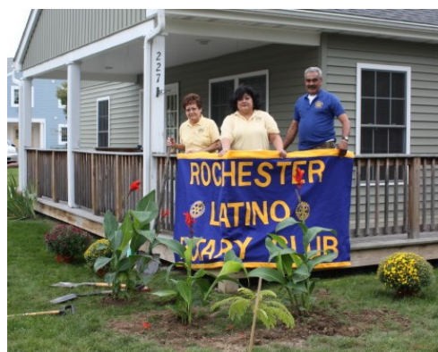
The “gardeners” at work (Left) and admiring their work (Right)

The Literacy Committee has continued its support of the school in El Sauce, Nicaragua by sending school supplies. Dictionaries for the Eugenio María de Hostos Charter School have been ordered, and the Committee expects to deliver them to the fourth graders in early November. There several requests for assistance from other schools that are under consideration, including tutoring at School #28.