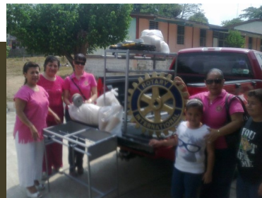
T-C Club members deliver stove to school. It replaces a dilapidated one below.