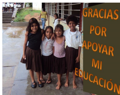
Above: Message reads—Thanks for Supporting my Education

It is also following up the progress of the project in Tuxtepec-Cuenca made possible by a grant from the Rotary Foundation. This project includes the purchase of equipment for classrooms such as sewing machines, wood working saws, stove, computers, fans, etc. to make it possible to better educate indigenous Mexican children.