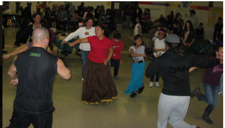
Clockwise from top: Crafts, music, zumba and Mandinga at School #28—Oh, how fun it was!