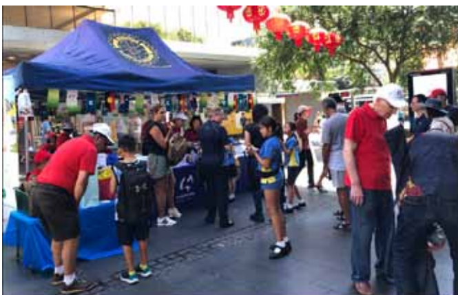
Australia Day Stall in Willoughby Mall.

Community Service Director. 2022 - 2023.