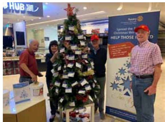
Tree of Joy