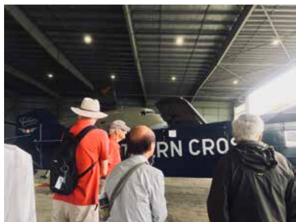
The Southern Cross