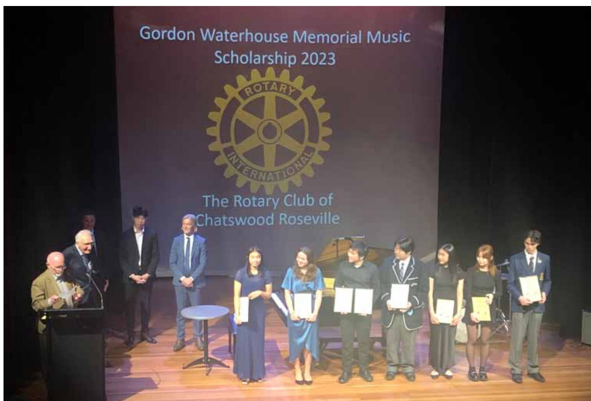
PHOTO - GORDON WATERHOUSE MEMORIAL MUSIC SCHOLARSHIP 2023; REPORT NEXT BULLETIN

CROWNE PLAZA HOTEL TERRIGAL SPECIAL ROOM RATE OFFER CLOSES 30 JUNE 2023 Friday 15 March 2024 Saturday 16 March 2024.