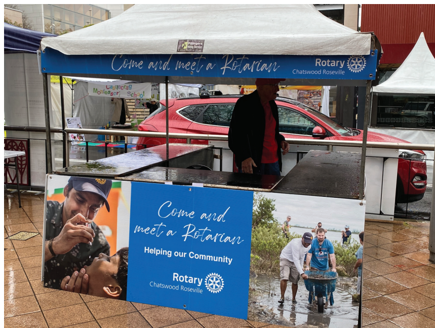
At left; Setting up our stand at the Fair.