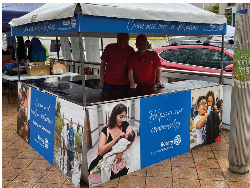
At right; All ready for the influx of enquiries.