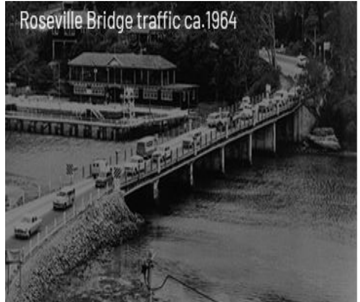
Roseville Bridge traffic ca.1964