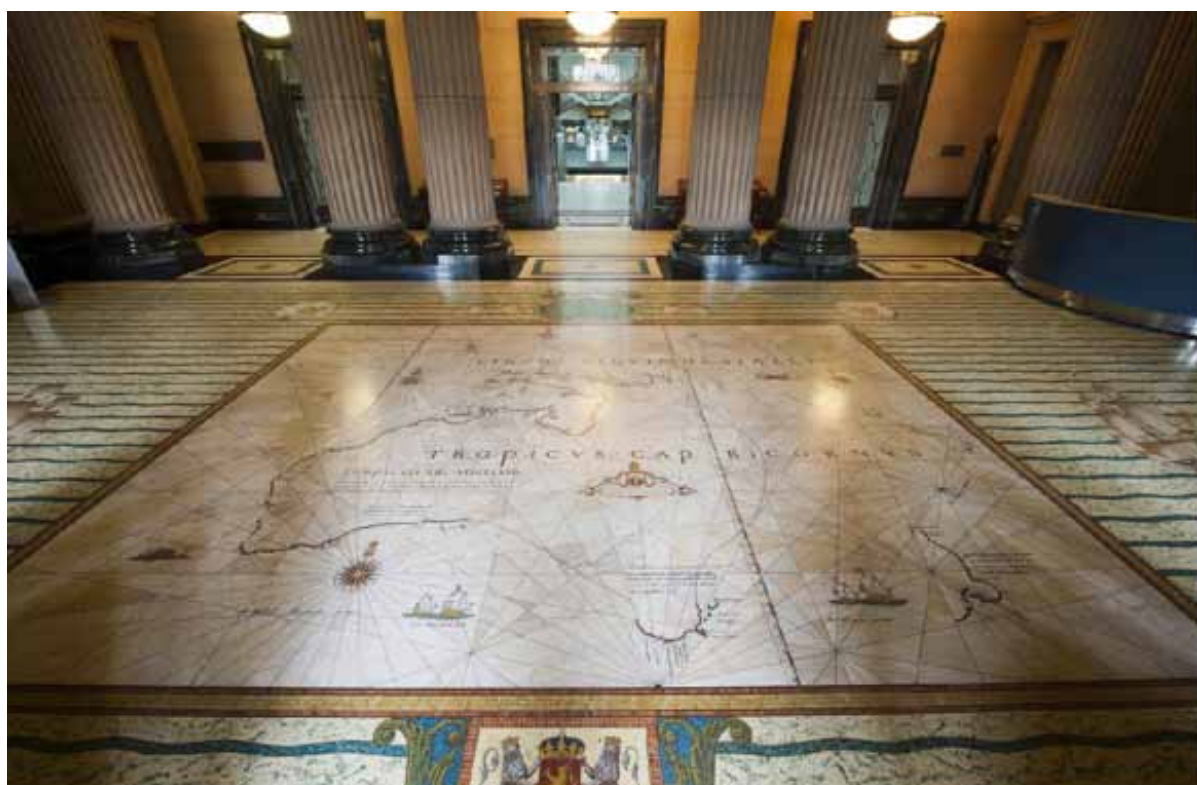
The Mitchell Library Vestibule and the Tasman Mosaic Map