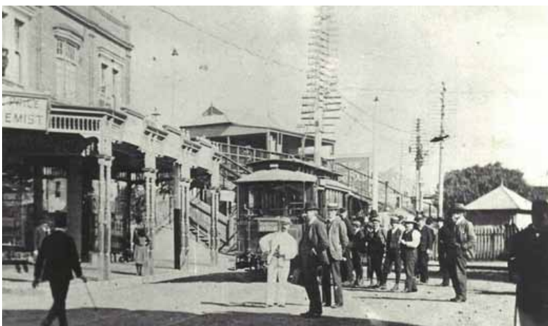
At left; The arrival of the first tram at Chatswood Railway Station in the Upper North Shore of Sydney on 24 July 1908.