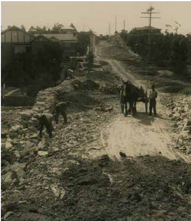
At left; Archbold Road being constructed. Thankfully its been upgraded.