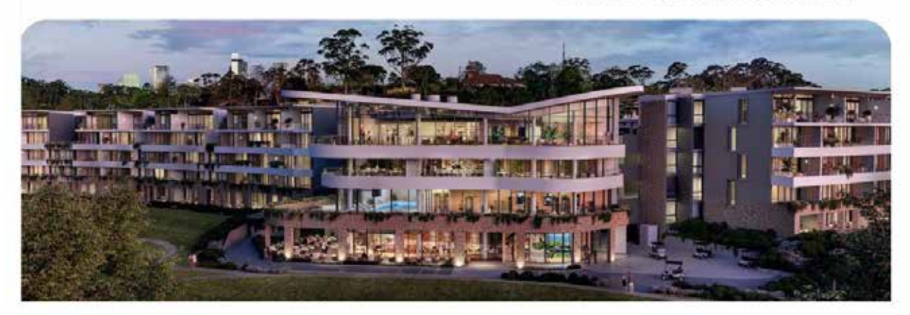
LUXURY RETIREMENT LIVING ON SYDNEY'S LOWER NORTH SHORE.