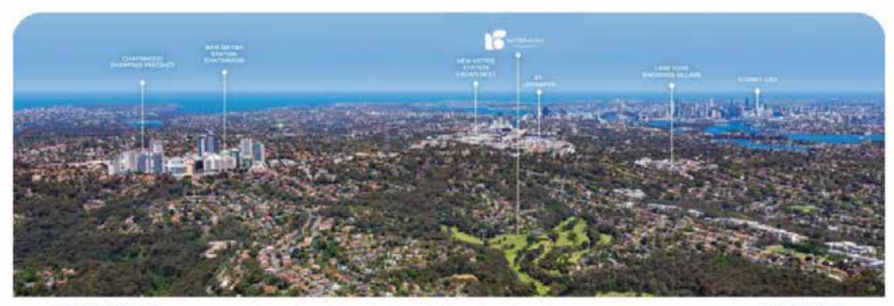
BY PARITER AND

Watermark Residences prioritises wellness as an essential aspect of daily life, supporting your journey towards healthy ageing and enabling you to continue enjoying your lifestyle. Our residents will enjoy convenient access to a hydrotherapy pool, a well-equipped gym, and dedicated wellness areas. Additionally, we offer exclusive exercise classes designed to enhance and sustain your strength and fitness levels. We are creating a place where you can enhance your overall wellbe-ing and foster connections with friends.