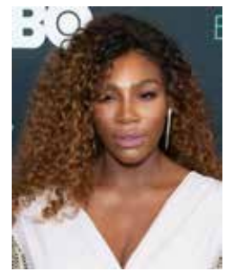
1982 Serena Williams