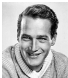
2008 Paul Newman