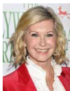
1948 Olivia Newton-John