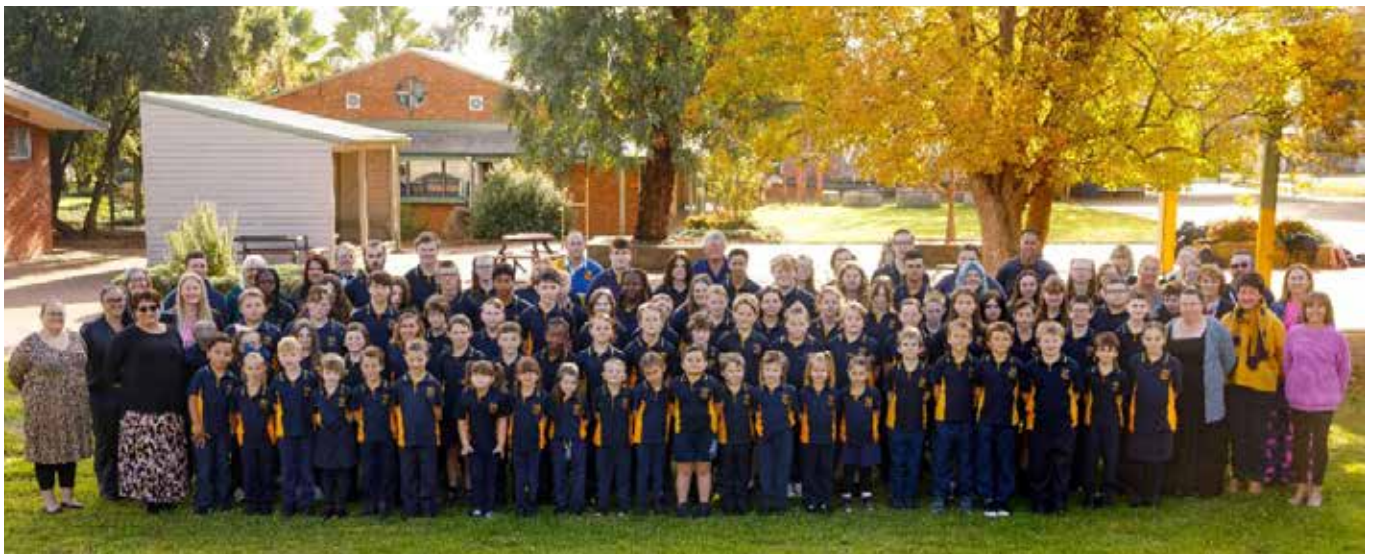
The whole school