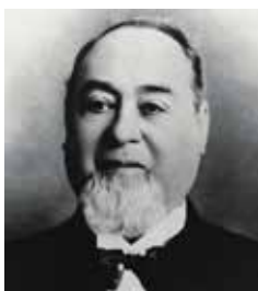
1902 Levi Strauss