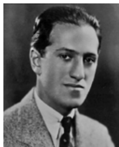
1898 George Gershwin