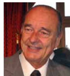
2019 Jacques Chirac