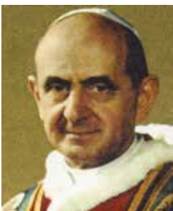
1897 Pope Paul VI