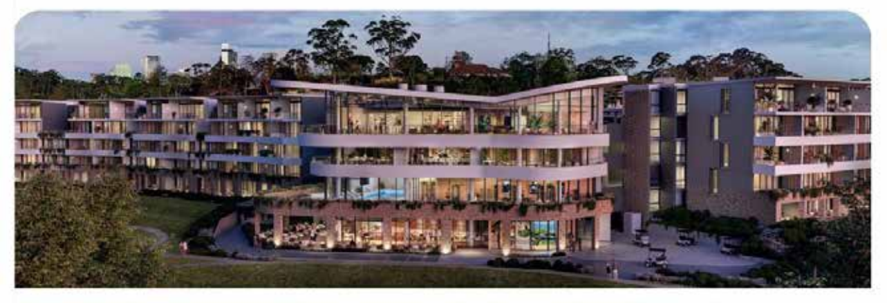
LUXURY RETIREMENT LIVING ON SYDNEY'S LOWER NORTH SHORE.