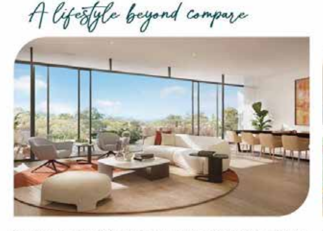
Exquisitely appointed 2, 3 and 4 bedroom apartments delivering quiet luxury with maximum impact. Watermark Residences have been designed with a focus on you, with every apartment offering uninterrupted and breathtaking views of Chatswood Golf Course, Lane Cove River Valley and beyond. Spectacular living and entertaining are guaranteed with beautifully articulated indoor spaces and expansive balconies made for celebrating life