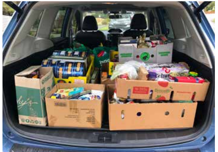
Just some of the goodies collected.