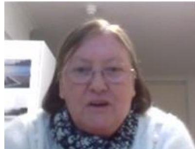
Toula telling false hood and Deretta a picture of honesty