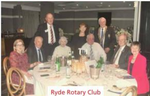
Ryde Rotary Club