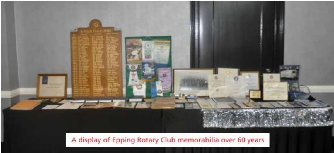
A display of Epping Rotary Club memorabilia over 60 years