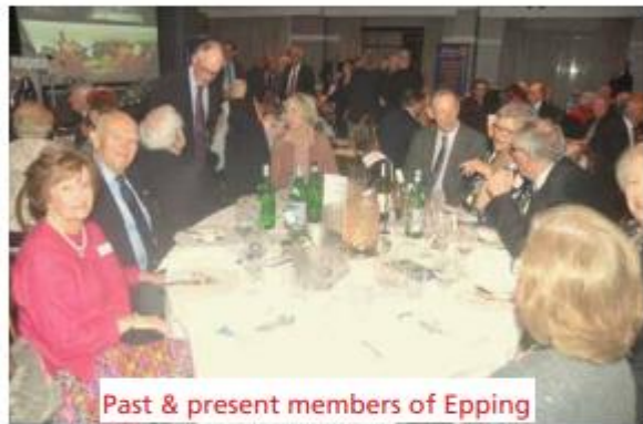
Past & present members of Epping