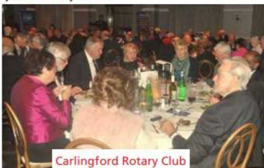
Carlingford Rotary Club