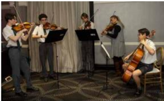
Epping Boys High School String Ensemble provided the musical background at the start of the evening,

Rotary Clubs attending were: Ryde (Mother Club), Carlingford (Daughter Club), North Rocks (Grand Daughter Club), Berowra, Lane Cove and Turramurra.