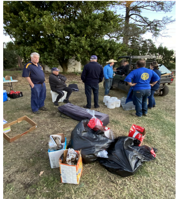
Resting and clearing up after a long day