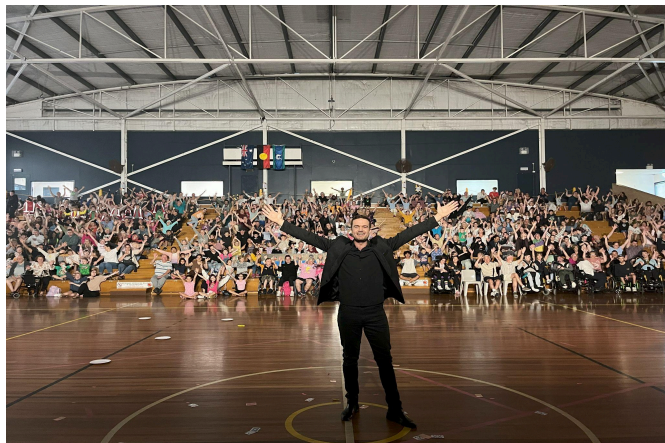
Razzmatazz full house