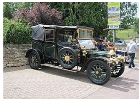
1910 STANDARD 30