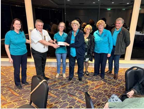
The Gang from Riding for The Disabled