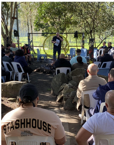
The Glen for Men

In Zone 8 (South Pacific including Australia and NZ) there are 1,181 Clubs and 27,606 members which is an increase of 294 members this year.