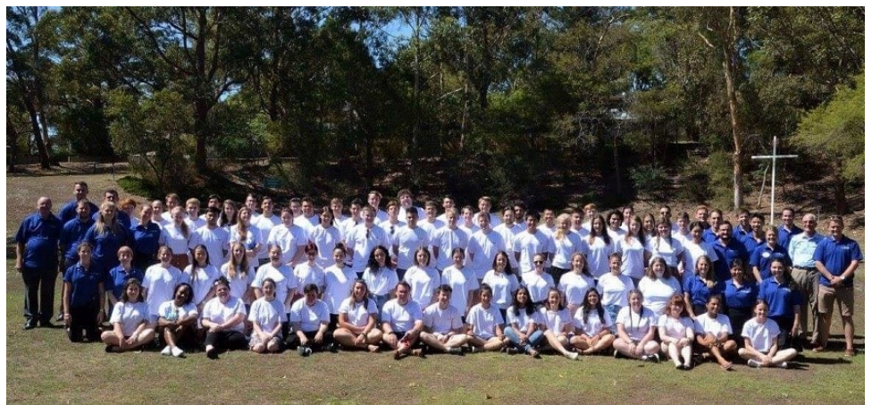
Official group photo of all RYLA 2018 awardees from our district.