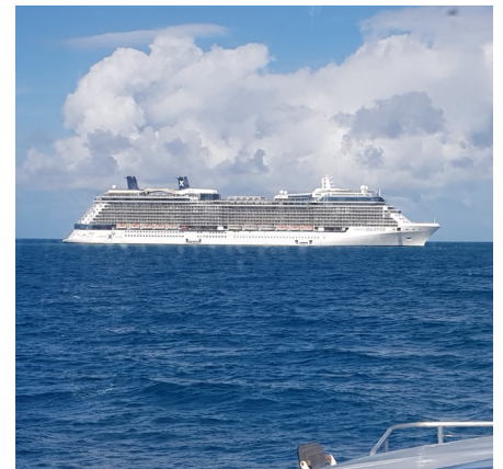
Celebrity Solstice off Cairns