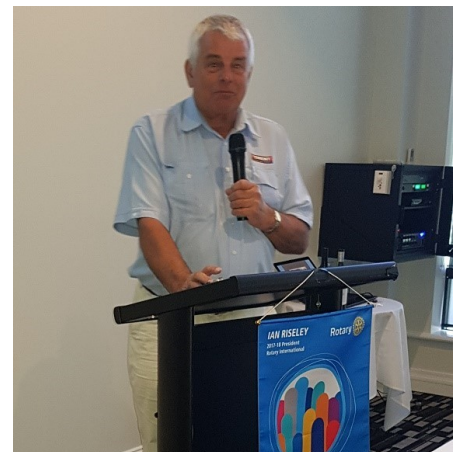
Our distinguished Speaker Rotarian & Ex-Jackeroo

The experience of hard work and challenging times proved a real asset and served him in good stead for his now 40 years with Trent Driving School.