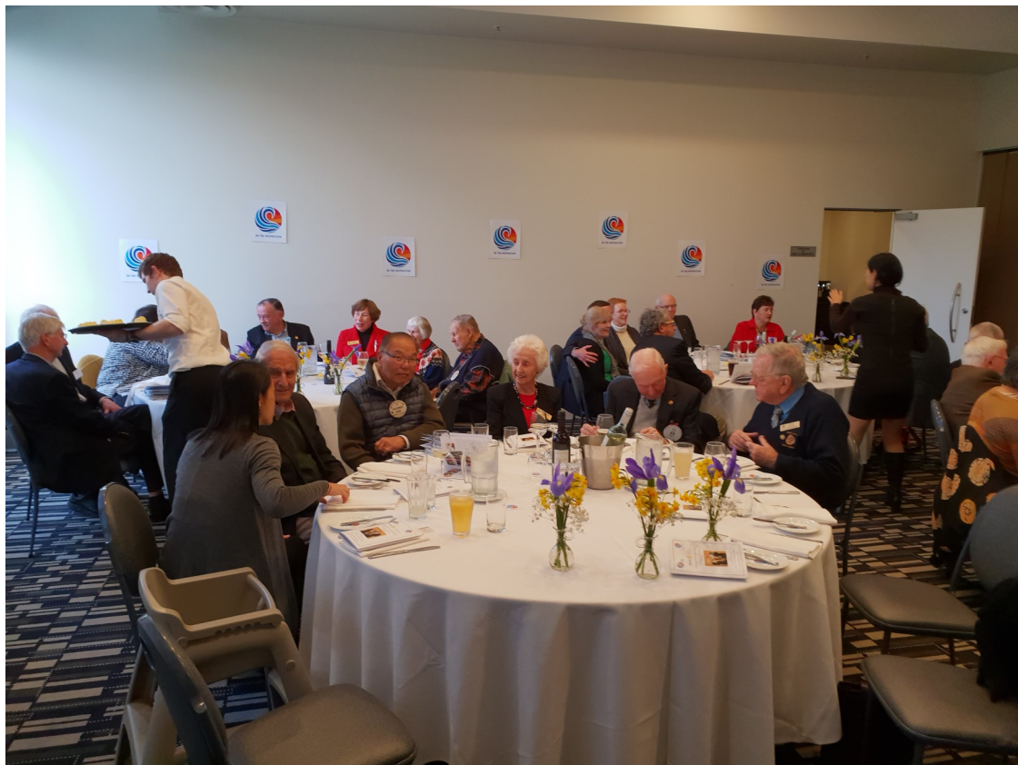
Guests enjoying Changeover Lunch