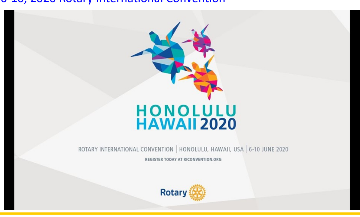
June 6-10, 2020 Rotary International Convention

March 20-22 Reasons Conference 2020 - Wollongong