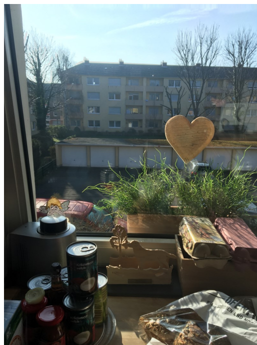
Breakfast at Klaus's house before citation

Progress was slow however as I was on the phone for about 4-5 hours to various people who I had to say my goodbyes to or to people back in Australia that I had to inform of these events. I couldn't say how Australia took the news but I can say for a fact that Belgium had a massive mess to clean. Rotary clubs, ambassadors and countries in lockdown. So you could imagine the amount of panic that the 200+ exchange students were feeling.