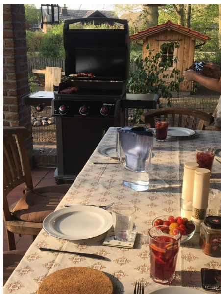
Breakfast in Ludinghausen

The next morning, admittedly I had almost one hand in this, it was all 9685 and the people behind it things were set into motion. I continued my not so efficient packing process periodically making sure that nothing more was happening over the phone. When 9685 had successfully contacted Germany and Germany was willing to take me in.