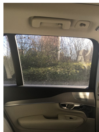
Travelling between Maastricht and Eskirchen

His address is Baumschulenweg 6 59348 Lüdninghausen Germany