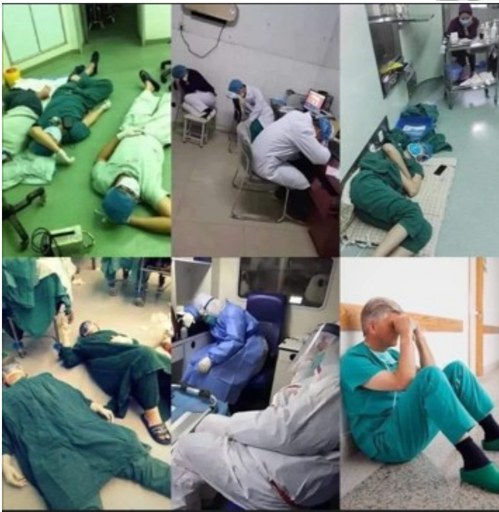
Above: Exhausted Medical Staff