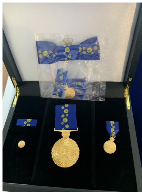
Medals and bows!