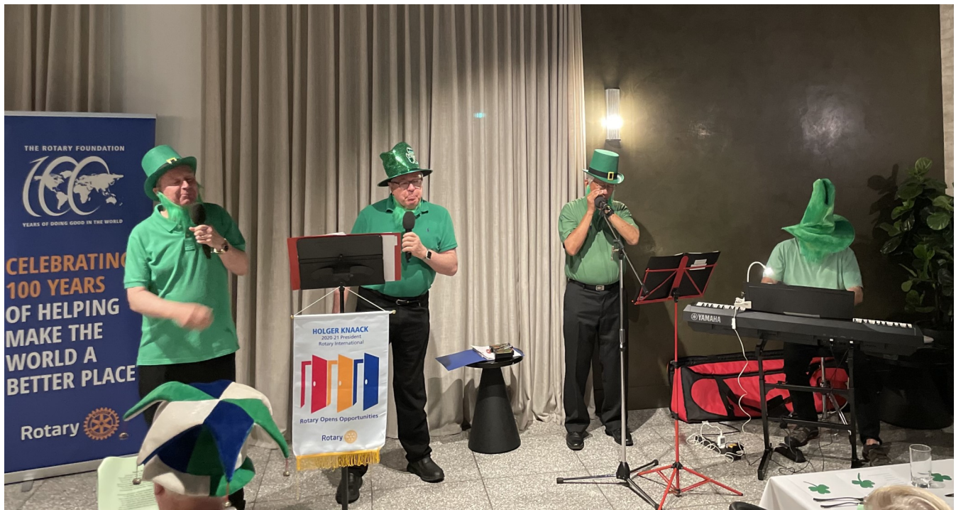
Above: Tokens Performing Below: Raffle Prizes