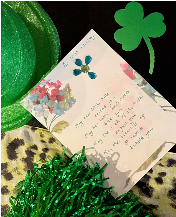
Above: Irish Blessing Below: Raffle Prizes