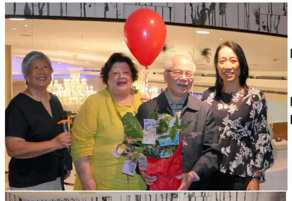
Left: Money Tree Winner

Right: Loyal Supporter Determined to Win