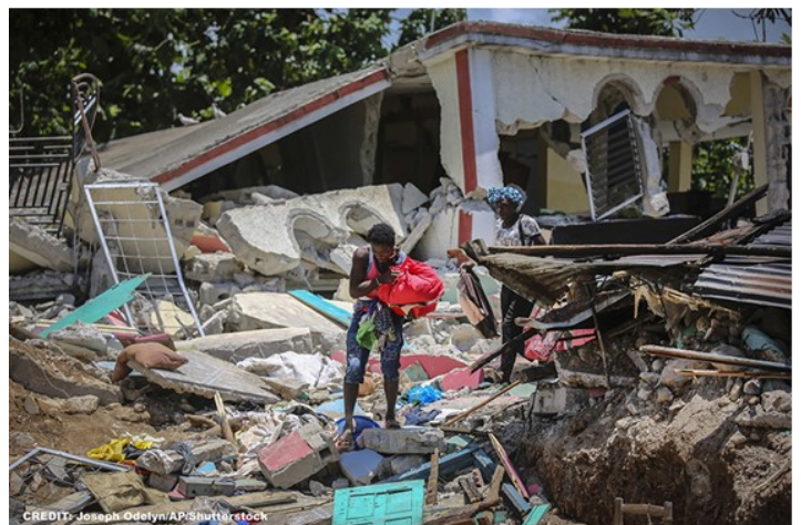
HAITI - EARTHQUAKE/TROPICAL STORM

A powerful 7.2 magnitude earthquake on Saturday 14 August and continuing aftershocks have rocked Haiti. Heavy rains and mudslides from Tropical Storm Grace have made the need for emergency shelter even sharper.