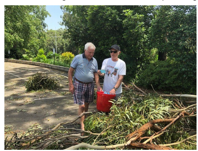
The drawing of the ticket amongst the fallen trees at the golf club

The trailer and the goodies are now on their way to Mudgee with a very worthy recipient.