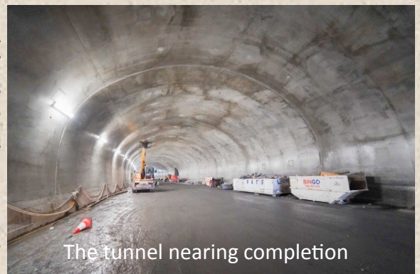
The tunnel nearing completion

points including Wilson Road, and handled shale, clay and sandstone. Geotechnical chaps went in periodically to inspect rock conditions. Their reports would determine any necessary supports and rock bolting. Shotcreting of the exposed surfaces followed and then a surface miner trencher went in to take out another 2 metres from the flooring. This tunneling went on 24/7 and the first break through was in September 2017, a great opportunity for the pollies to don their hard hats and orange vests and join the crowd of 150 visitors and media. There will be a control centre near Pennant Hills Golf Course to monitor and control tunnel traffic and large axial flow fans