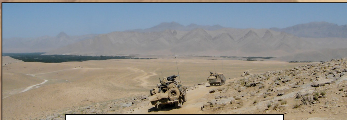
On patrol in Afghanistan's Kandahar Province