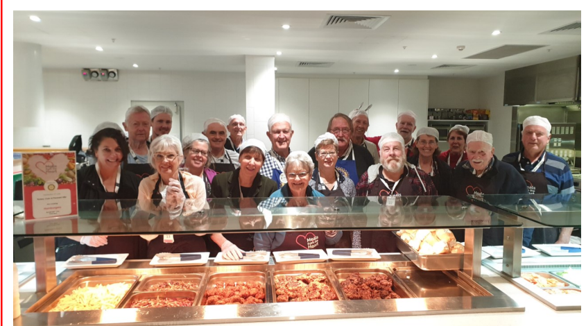
Our group assembled prior to serving the main meal

A surprise finish to the evening was the 'early mark' we were given while the wash up was in full swing. However, the chef advised that the evening volunteers would take over from us and finish the clean up. So we were on our way before 9.00pm. All in all, I thought it was a very good night of 'Service Above Self'.