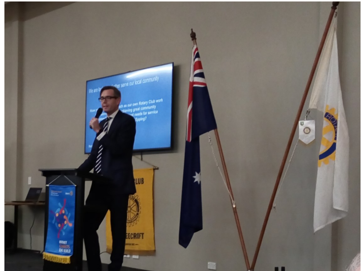
The Guest Speaker addressing the meeting