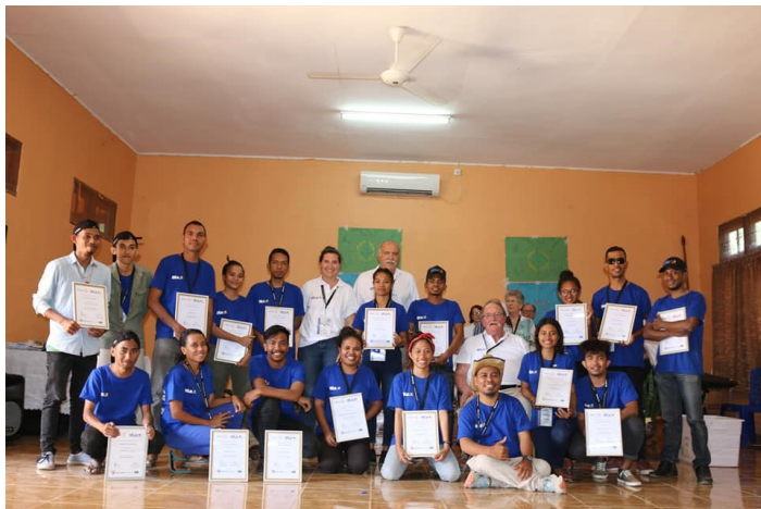
The RYLA leadership team at the conclusion