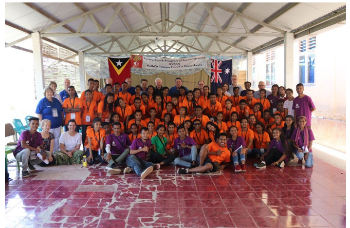
The RYPEN participants and leaders held at Dare