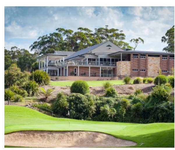
Cost: $125 per player Includes, Golf, Breakfast & Lunch