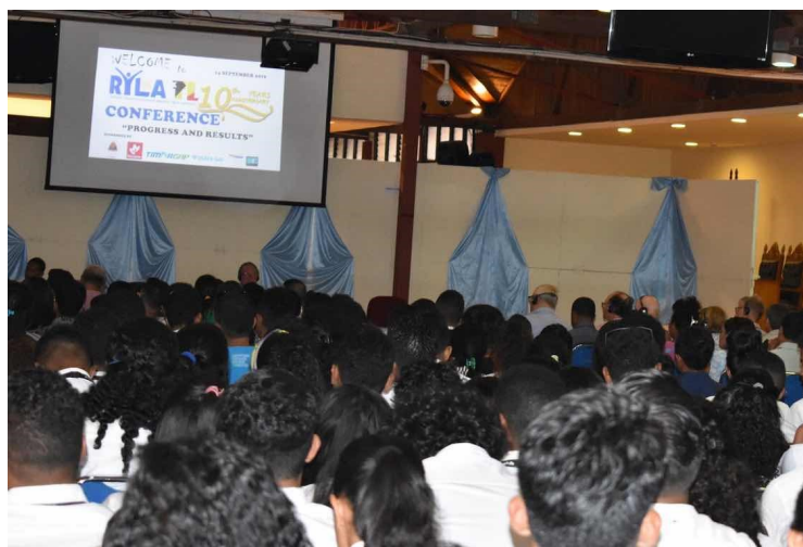
Part of the crowd of 500+ who attended the celebration of the 10th anniversary of RYLA