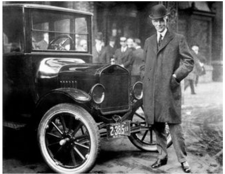
Henry Ford posing with one of his production models