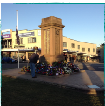
Wreathes laid At the Cenotaph in Hornsby at the dawn service