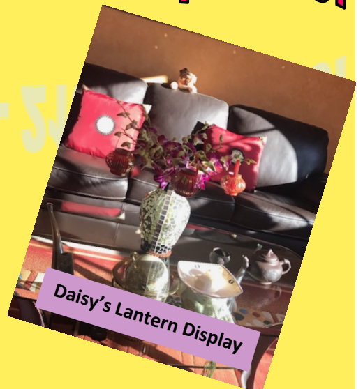
Daisy's Lantern Display