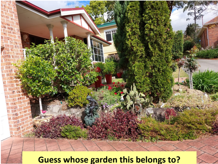
Guess whose garden this belongs to?