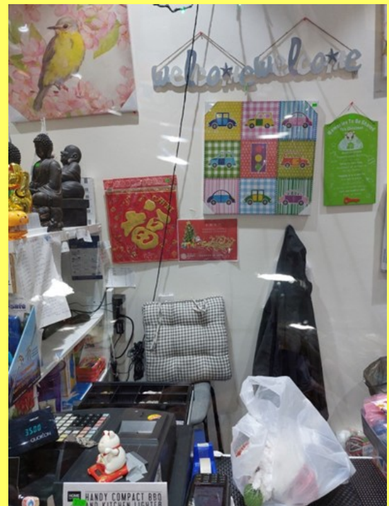
Our Christmas poster on display on the Thornleigh Marketplace notice board and at the $2 shop.