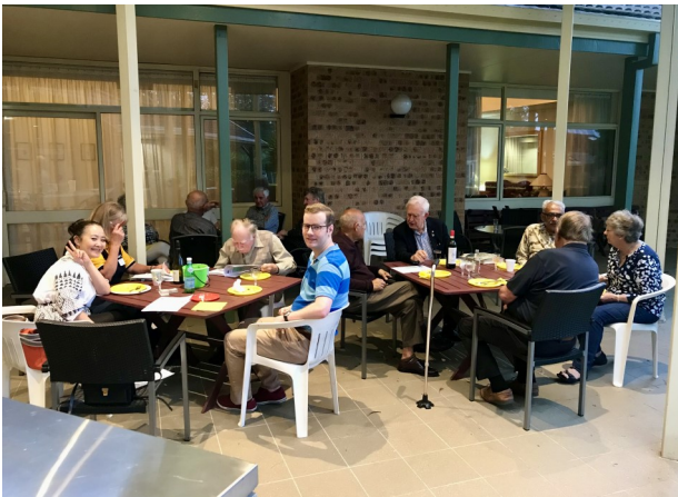
Photo of the assembled gathering for 'Poems at Lutanda'

1 Go on, look it up yourself. Or trust me – a poem, speech or song of lament