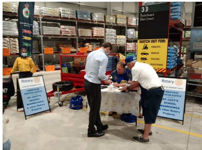
A couple of photos of the evening at Bunnings last Thursday