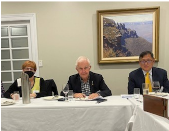
Photo from Last Week's Meeting