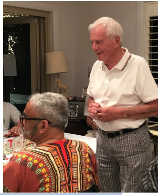
Above - Our gracious hosts