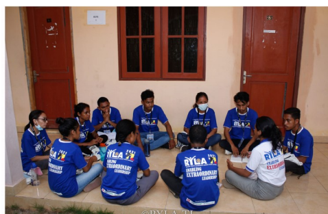
A BREAKOUT GROUP AT WORK

The following was gleaned from the Facebook page this week - https://www.facebook.com/300661416774117/posts/2019143984925843/?d=n